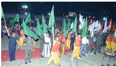
The Grand Finale