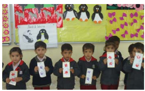
We made these cards to say that we know how much you care for us