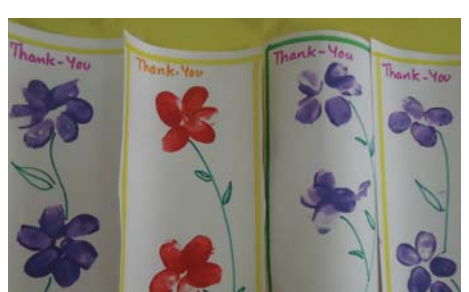
We made these flowers with our own thumb prints